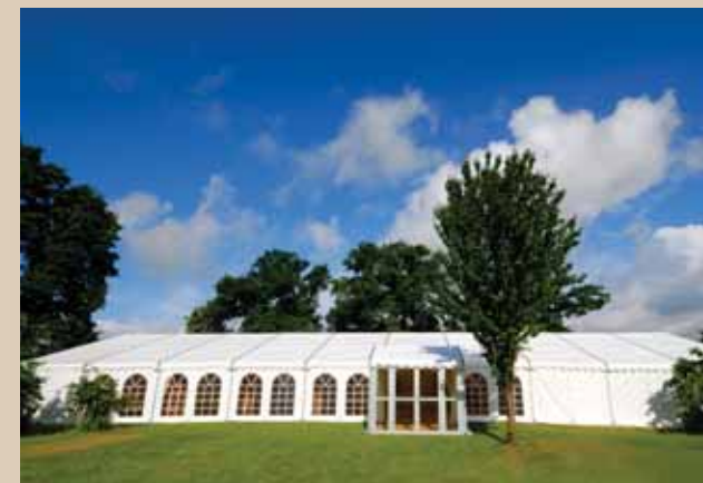
50' x 90' tent holds up to 220 people with dance floor.