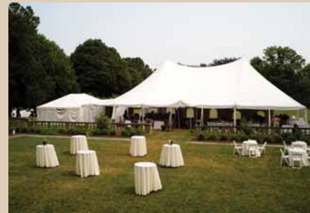
60' x 90' tent holds up to 300 people with dance floor.